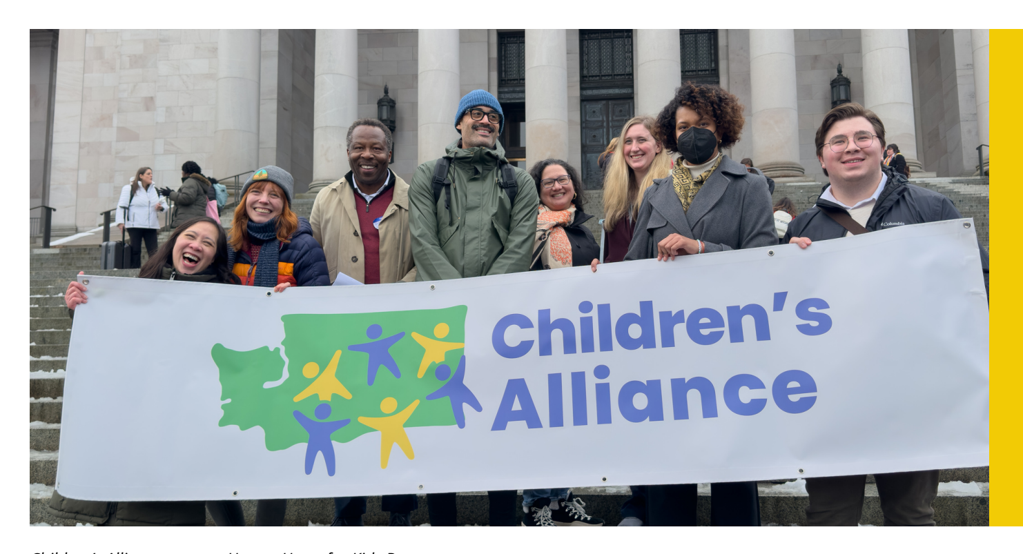
Children's Alliance team at Have a Heart for Kids Day

We are eager to continue the work on these important policies in 2025. Continued advocacy, often over many years, is necessary to implement large-scale, systemic change.